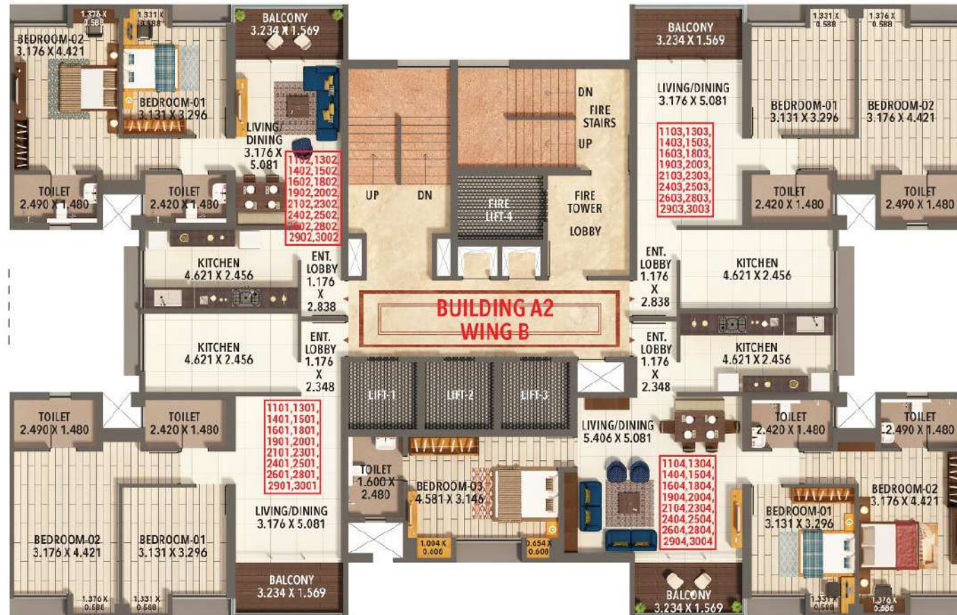
BUILDING A2 - WING B (AREA IN SQ.M.)