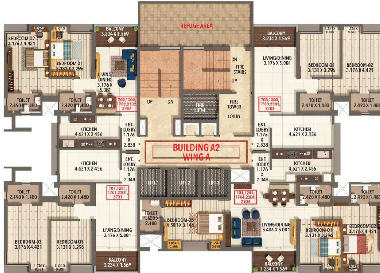
BUILDING A2 - WING A (AREA IN SQ.M.)