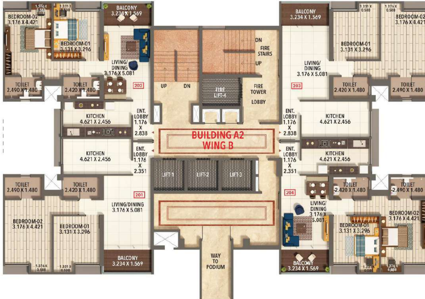
BUILDING A2 - WING B (AREA IN SQ.M.)