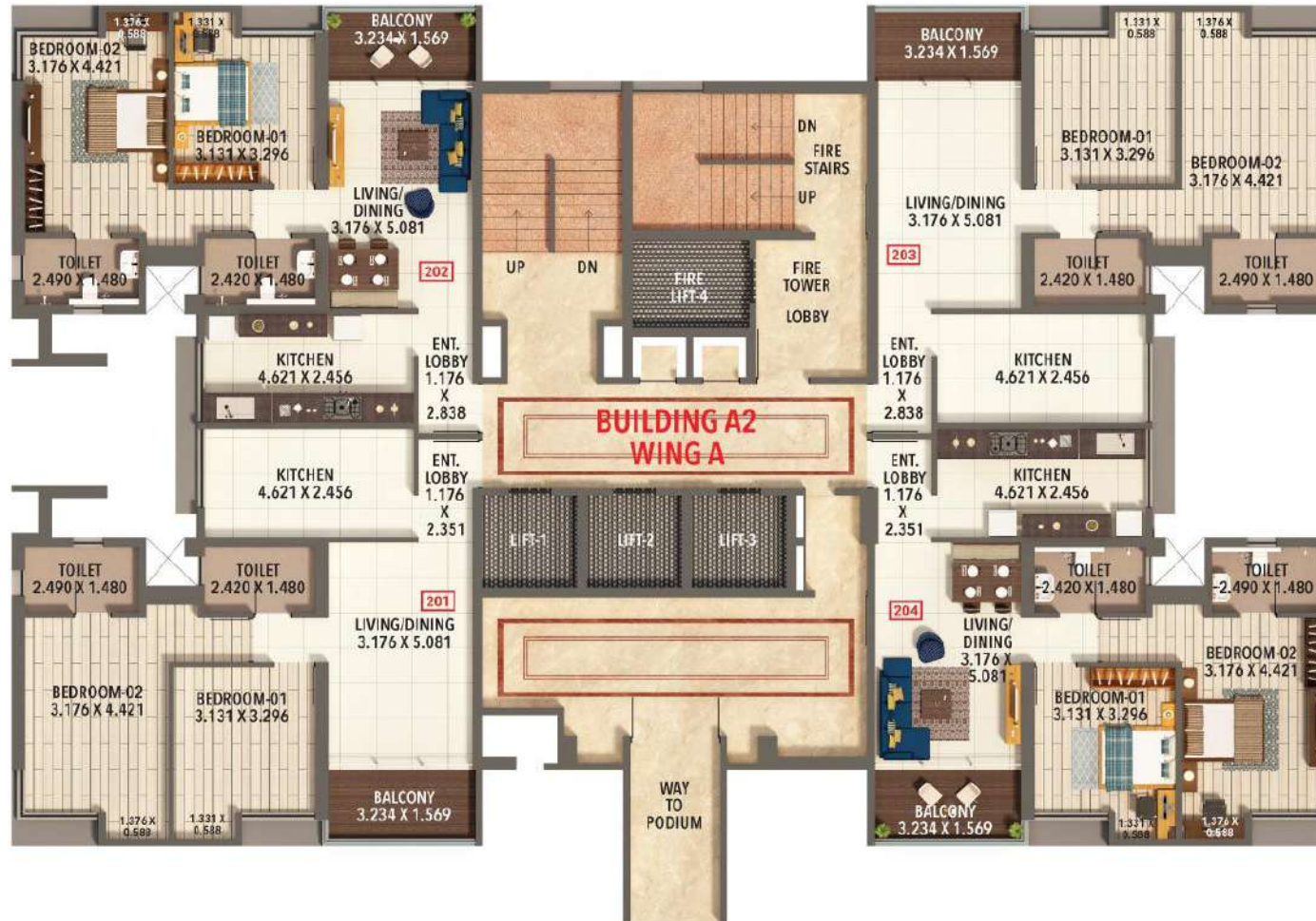
BUILDING A2 - WING A (AREA IN SQ.M.)